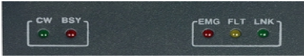
Illustration 1: Front indicators