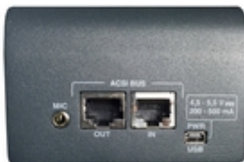
Ilustración 3: Entradas y Salidas