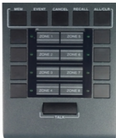
Illustration 2: Controls