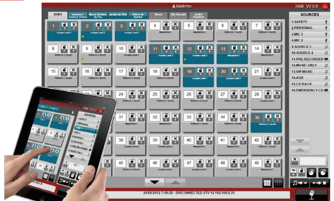
SIME Control (GUI)

Audio over Ethernet. Every NEO is capable of receiving up to 32 audio inputs from the data network (Cobranet) and route them to any zone in the system. In the above example, in Site 4 there are 4 analog audio inputs (3 music sources and a microphone) that the ZES 22 unit will convert to uncompressed high quality digital audio. These digital audio inputs can be routed from any NEO system to its zones or from SIME to any zone in the entire system.